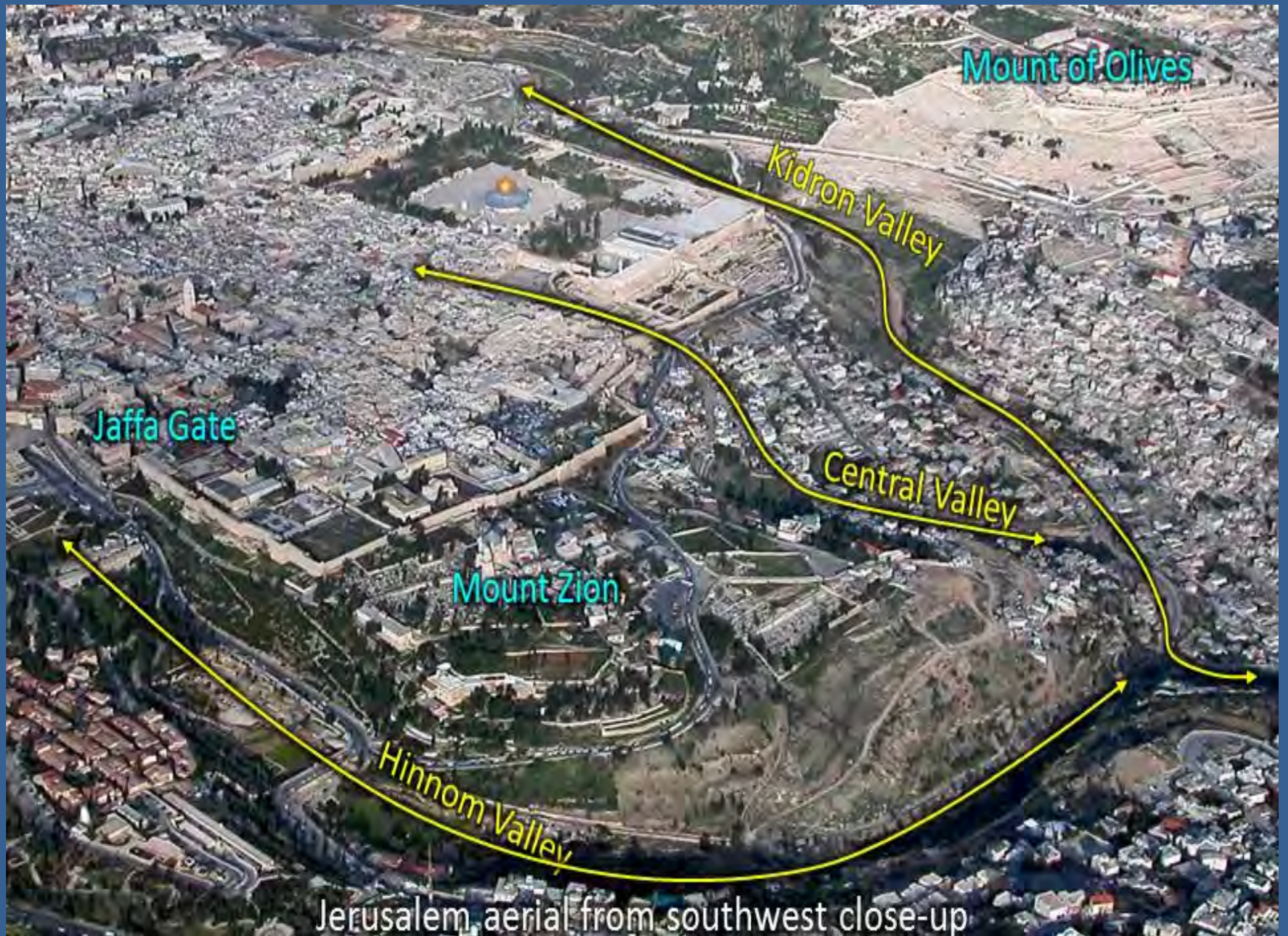
Jerusalem, aerial from southwest close-up