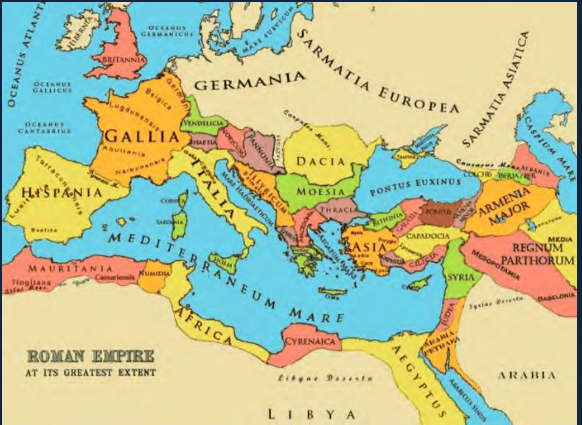
ROMAN EMPIRE AT ITS GREATEST EXTENT