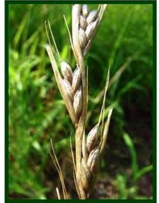
Wheat and Tares