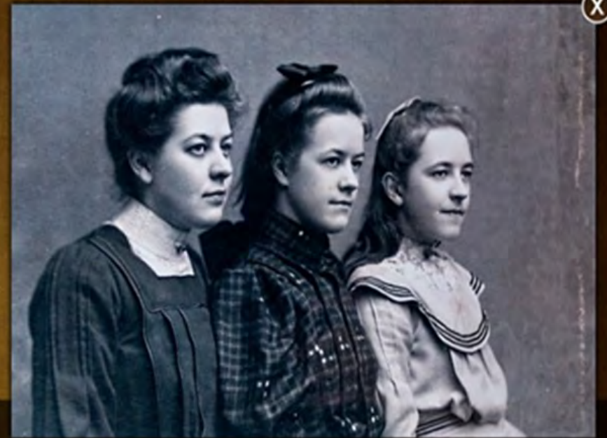
Betsie, Nollie, and Corrie ten Boom in 1905.