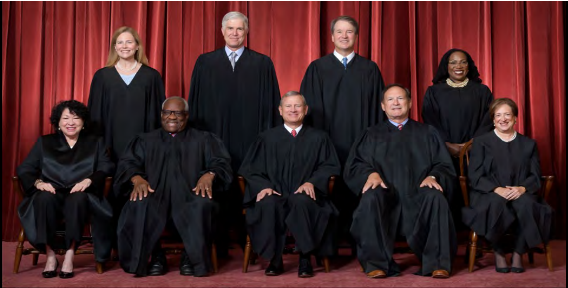
Front row, left to right – Associate Justices Sonia Sotomayor, Clarence Thomas, Chief Justice John G. Roberts, Jr., Associate Justices Samuel A. Alito, Jr. and Elena Kagan.